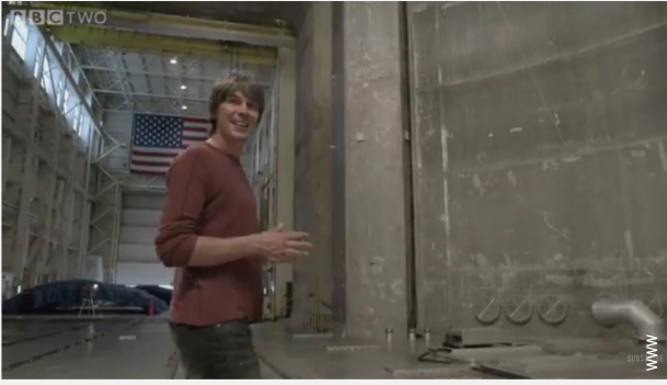
Brian Cox visits the world's biggest vacuum chamber - Human Universe: Episode 4 Preview - BBC Two.