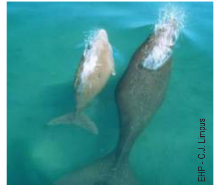
Moreton Bay dugongs.