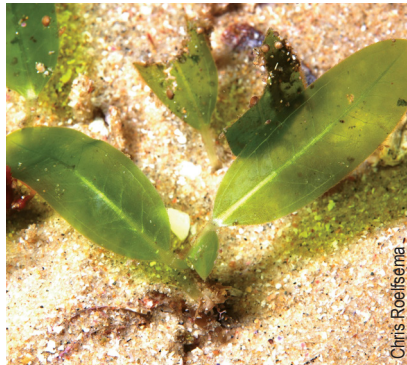
Moreton Bay seagrass, Halophila ovalis .