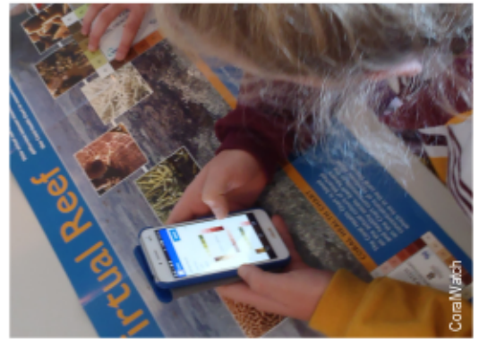
Students can practice entering data on the mobile App using demo mode with the virtual reef.