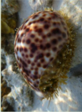
Tiger Cowrie Cypraea tigris