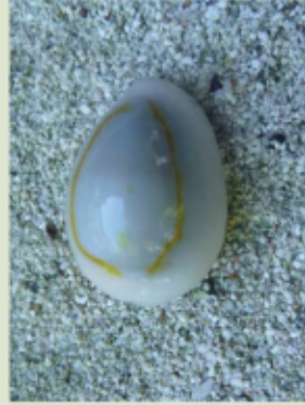
Gold Ringed Cowrie Cypraea annulus