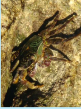
Tropical shore crabs Grapsus sp.