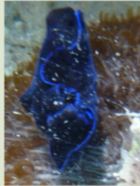
Phillip the Opisthobranch Philinopsis gardineri