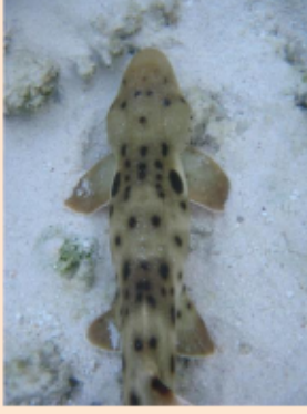
Epulette shark Hemiscyllium ocellatum