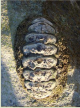
Chiton Acanthopleura spinosa