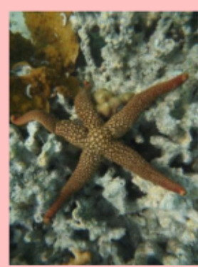
New Caledonian Star Nardoa novaecaledoniae