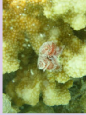
Christmas Tree Worm Spirobranchus giganteus