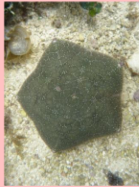
Pincushion star Culcita novaeguineae