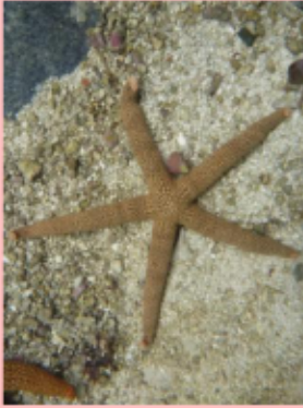
Tuberculate Star Nardoa tuberculata