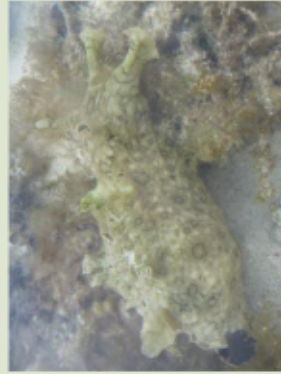
Common Sea Hare Aplysia dactylomela