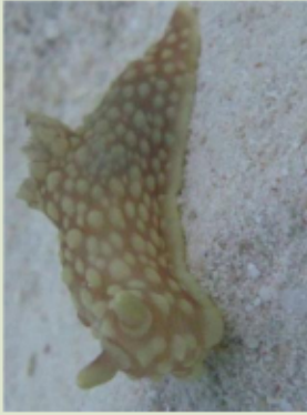
Jimmie the Nudibranch Gymnodoris sp.