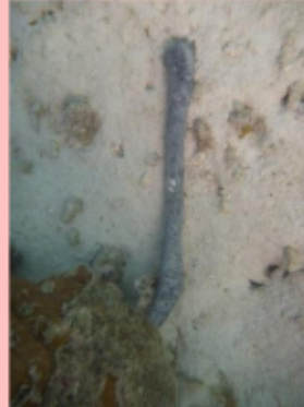
Stained Sea Cucumber Holothuria leucospilota