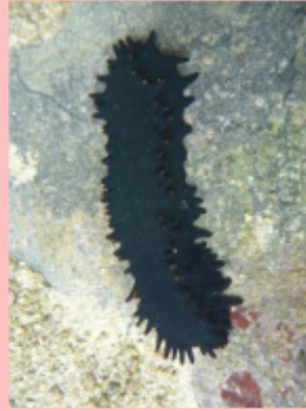
Greenish Sea Cucumber Stichopus chloronotus