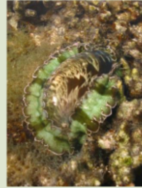
Ass's Ear Abalone Haliotis asinina