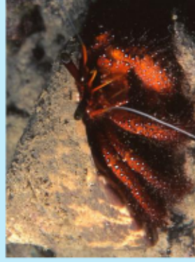
White spotted hermit crab Dardanus megistos