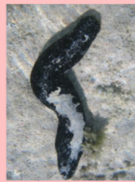
Black Sea Cucumber Holothuria atra