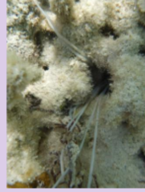
Spaghetti Worm Loimia medusa