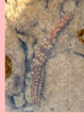
Tiger Sea Cucumber Holothuria hilla