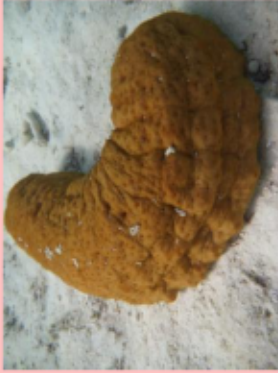
Variogated Sea Cucumber Stichopus variegatus