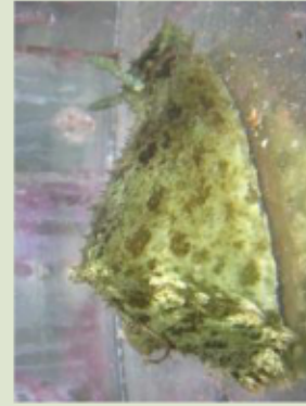
Flat Bottomed Sea Hare Dolabella auricularia