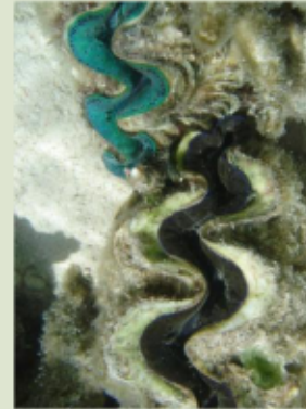
Giant Clams Tridacna spp.