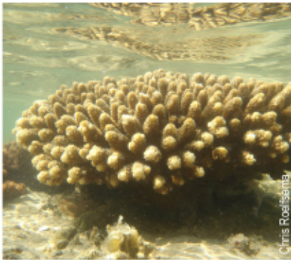
Moreton Bay corals.