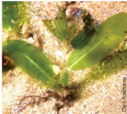
Moreton Bay seagrass, Halophila ovalis .